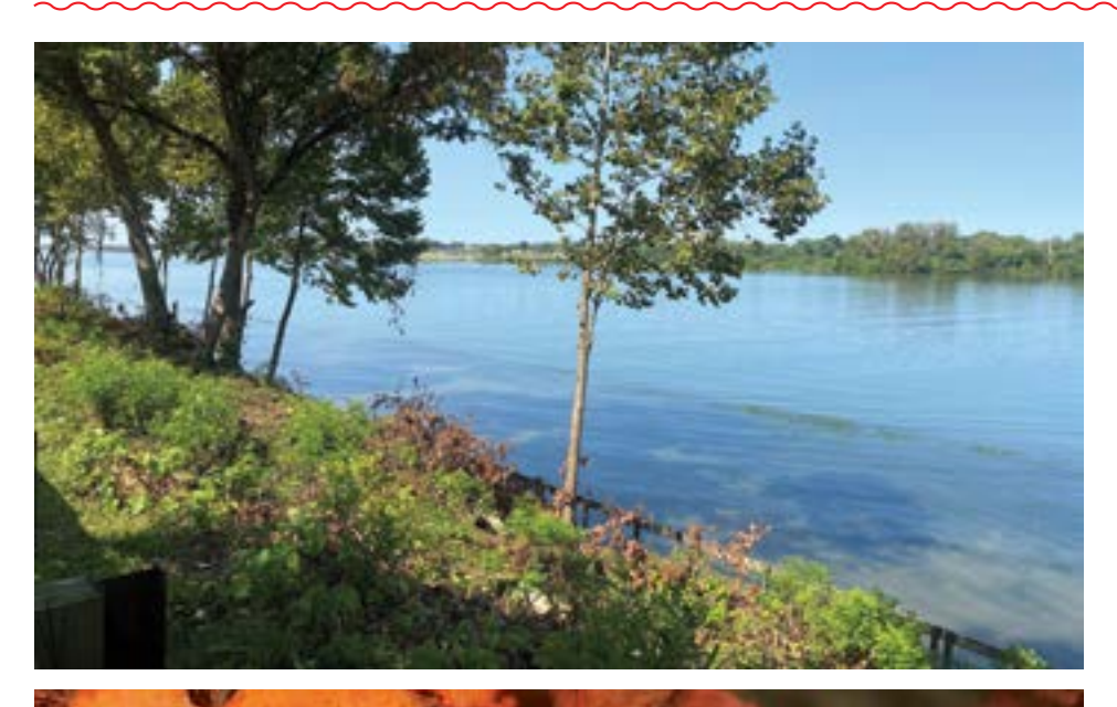
FAIRVIEW SCENIC VIEWPOINT ON RIVER ROAD, LOUISVILLE KY

Last spring River Fields helped lead the fight against an ill-conceived proposal to create a barge repair facility at the foot of Six Mile Island. We're glad to report – in case you missed the Courier-Journal's article on it – that the proposal has been withdrawn. River Fields is grateful to all of our supporters who helped us call attention to what could have been a massive source of noise and light pollution for wildlife, not to mention a threat to the safety of our water.