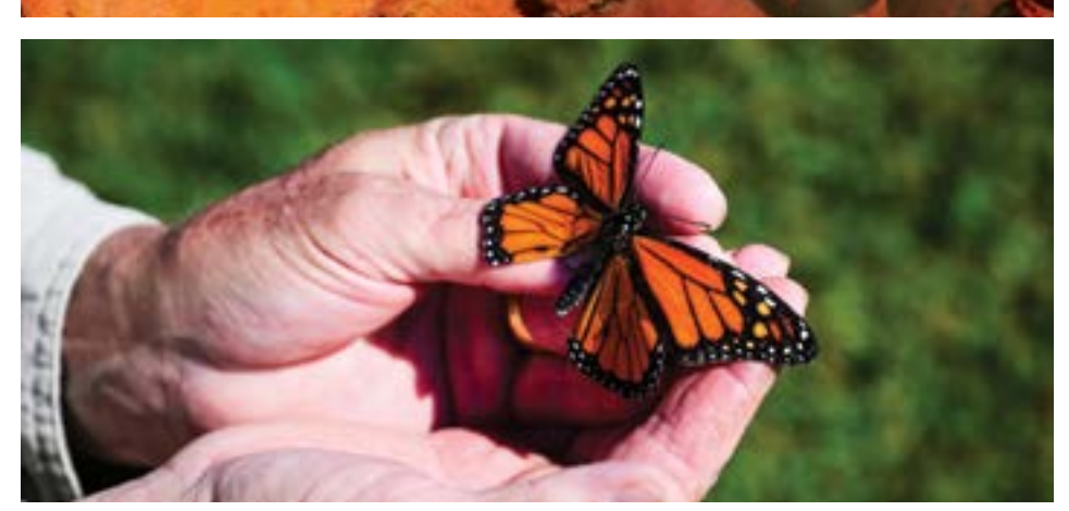
GARVIN BROWN PRESERVE