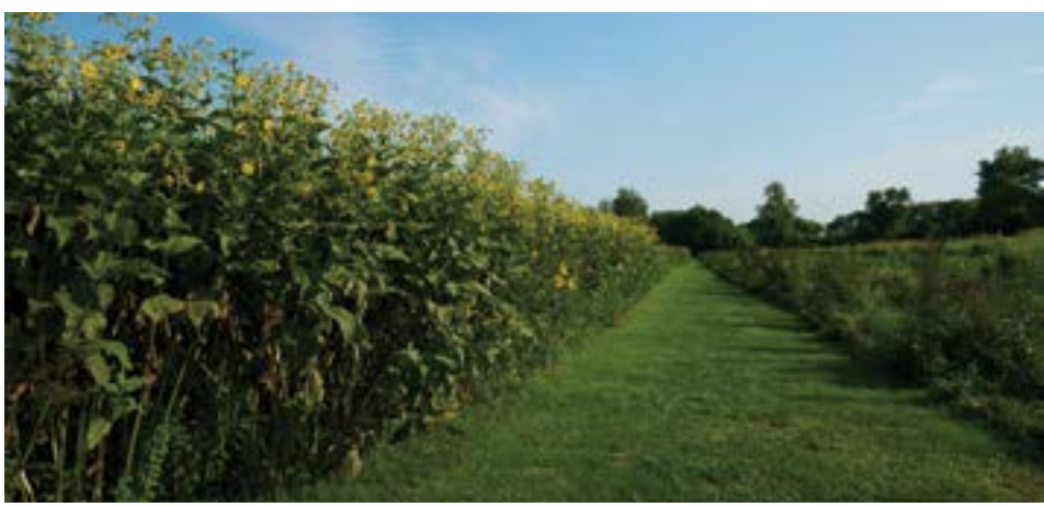
GARVIN BROWN PRESERVE