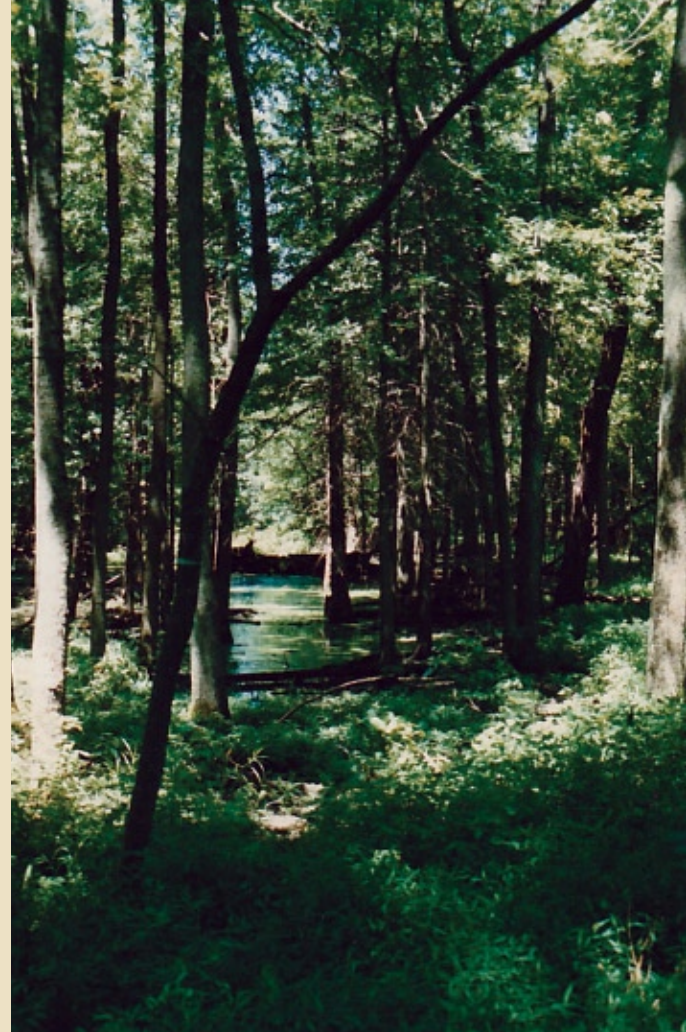
Garvin Brown Preserve